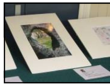
The winning photography on display.