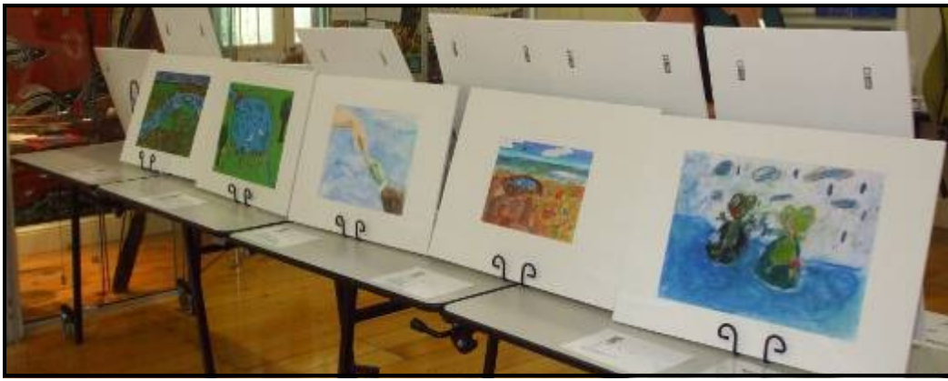
The winning works in the Murray-Darling Basin Authority Children's Art Junior on display.