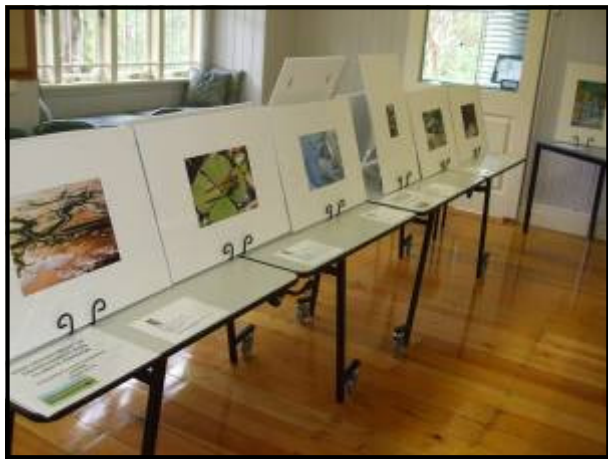
The winning photography on display inside the centre and on the verandah