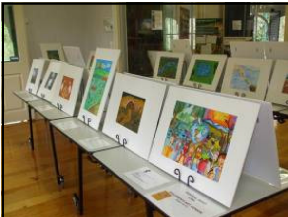
The winning works from the Central West CMA Children's Art Junior category on display.