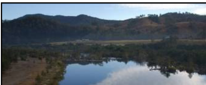
Photo: Upper tributaries of the Mann river (Wetlandcare Australia)